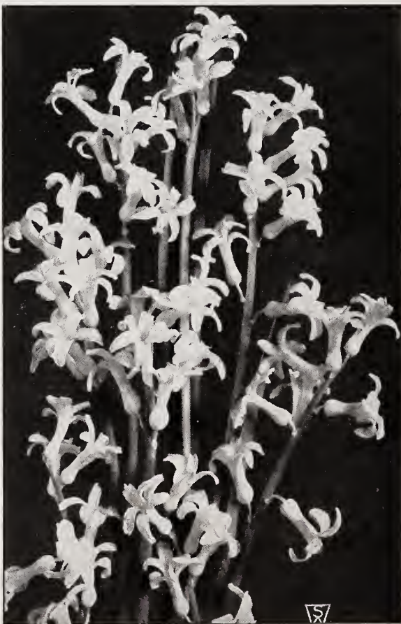
French Roman Hyacinths

Our patrons desiring Hyacinths for culture in glasses are advised to select varieties from page 16. We offer Hyacinth Glasses, both Belgian and Tye shape, at 45 cts. each, $4.50 per doz.